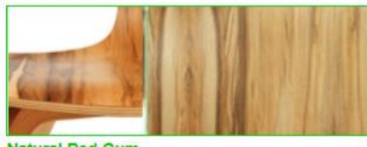
Natural Red Gum