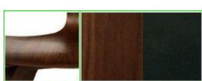
Walnut and Ebony

Aniline dyes and water-based low VOC varnishes are used to produce a finish where the natural grain texture of the wood is clearly visible with uniform color throughout. Classic color finishes are: Walnut, Ebony or Stella Orange.