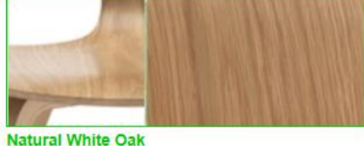
Natural White Oak