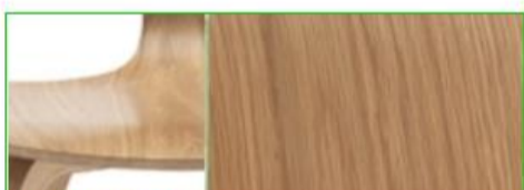
Natural White Oak

"Natural" finishes have a clear top coat where the natural variations in the color and the grain of the wood are clearly visible. No stain or color enhancements are used. Seating products with a "Natural" finish include: Beech, Red Gum and Walnut.