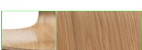
Natural White Oak

"Natural" finishes have a clear top coat where the natural variations in the color and the grain of the wood are clearly visible. No stain or color enhancements are used. Seating products with a "Natural" finish include: Beech, Red Gum and Walnut.